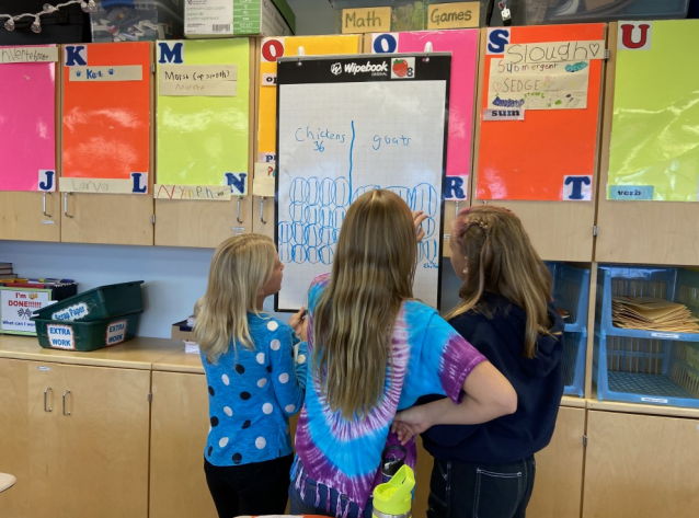
Grade 5A Wetlands STEM Project and Building Thinking Classrooms Math Problem