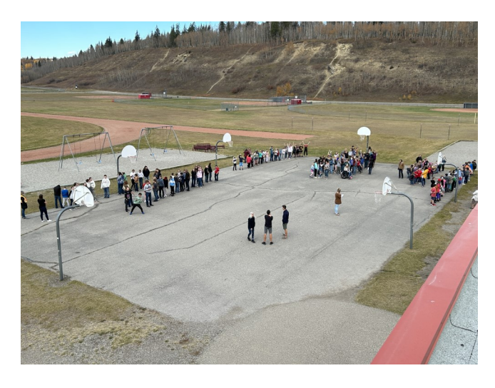
As part of Fire Prevention Week RVS students practiced how to safely evacuate the school during the October fire drill.