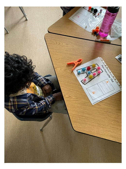
Kindergarten students working hard on their letter and fine motor skills!