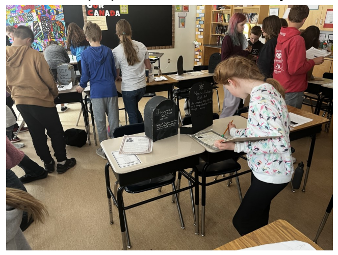
Gr 7 Tombstone Walk Students created an obituary and tombstone for a European explorer of Canada