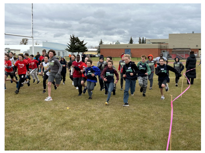
KM Club wrap up / CESD Cross Country Run